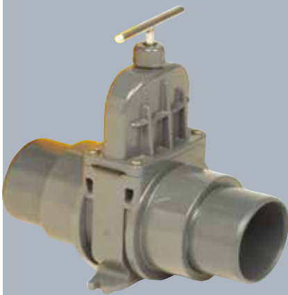
PVC inlet sluice valve DN 100 or DN 150, with pipe sockets bonded in, for the time-saving and space-saving direct connection to the inlet clamping flange.

LI8tuae315B0362574 40 1sBrāmpo67 0Ⅱ0.2 rāmp