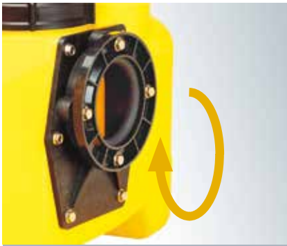
Height adjustable clamping flange compl i 400